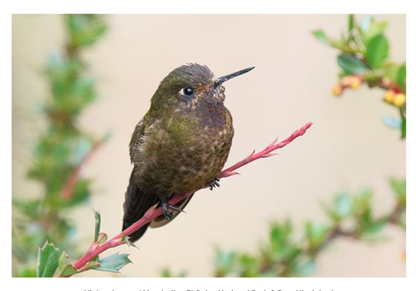
Violet-throated Metaltail at El Cajas National Park

In the high temperate and páramo-zone elevations of El Cajas National Park, we'll search for mixed foraging flocks and their attendant tanagers and scan flowering trees and shrubs for an array of hummingbirds with names as angelic as their appearances, including Greentailed Trainbearer, Shining Sunbeam, Ecuadorian Hillstar, Mountain Velvetbreast, Great Sapphirewing, Sword-billed Hummingbird, Purple-throated Sunangel, and Viridian Metaltail. We will focus especially on locating the Violet-throated Metaltail, one of South America's most range-restricted hummers. Tanagers could include Hooded and Scarlet-bellied mountain-tanagers, Grass-green and Blue-and-black tanagers, Tit-like Dacnis, and Giant Conebill. A number of other specialties might show up as well, among them, Bearded Guan, Andean Condor, Gray-breasted Mountain-Toucan, and Giant Conebill to name just a few.