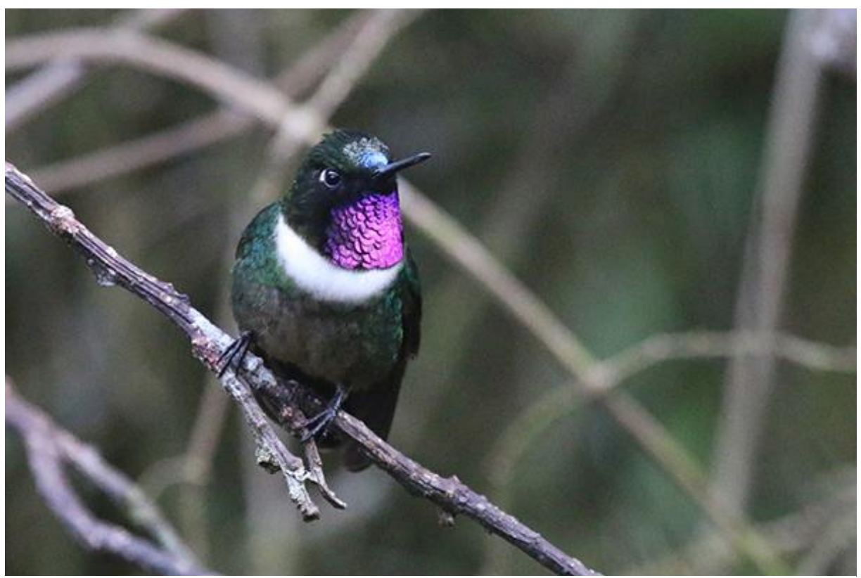
Amethyst-throated Sunangel

Ecuador has long been regarded as the planet's hummingbird and tanager epicenter, and on this exciting sequel to our Northern Ecuador Extravaganza, we'll experience many of southern Ecuador's prime habitats and ecosystems while in pursuit of these spectacular living gems that exemplify the glory of the Neotropics. This trip has been designed specifically for birding enthusiasts and photographers, along with anyone sporting a whim for the joys of Neotropical birding and a special focus on color and glitter! Of the nearly 200 species of hummingbirds and tanagers (including their allies) found in this region, we hope