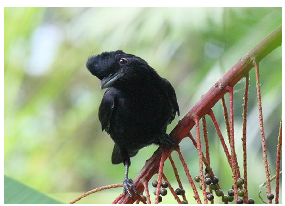
Female Long-wattled Umbrellabird