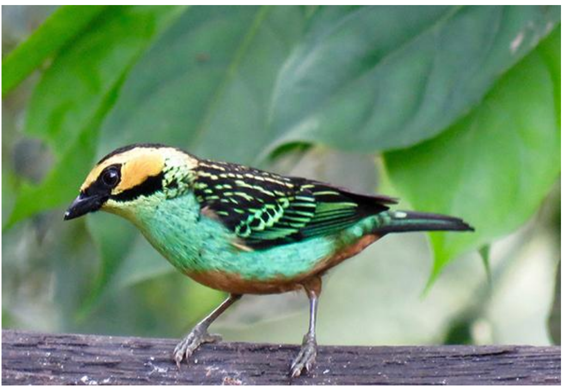
Golden-eared Tanager