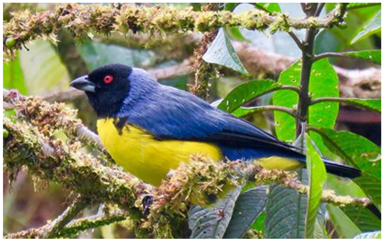
Hooded Mountain-Tanager