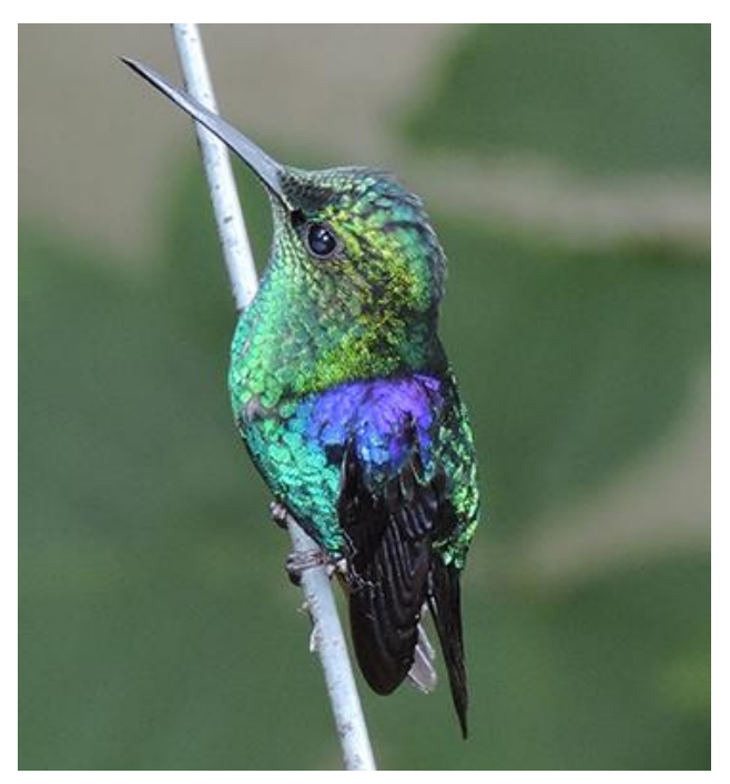
Male Emerald-bellied Woodnymph

August 25-26, Days 9-10: Two Days at Buenaventura Lodge. We will enjoy two full days at this incredibly birdy reserve. Among the possible hummingbirds are White-whiskered, Baron's & Stripe-throated hermits; White-tipped Sicklebill; White-necked Jacobin; Brown Violetear; Green Thorntail; Emerald-bellied Woodnymph; Violet-bellied Hummingbird; Rufous-tailed Hummingbird; Amazilia Hummingbird; Andean Emerald; Ecuadorian (White-vented) Plumeleteer; Purple-bibbed Whitetip; Green-crowned Brilliant; Fawn-breasted Brilliant; Brown Inca; Velvet-purple Coronet; Violet-tailed Sylph; White-throated Daggerbill; Purple-crowned Fairy; and Long-billed Starthroat. Tanagers can also be numerous here and we will watch for Fawn-breasted, Guira, Rufous-throated, Golden, Silver-throated, Flame-faced, Goldennaped, Beryl-spangled, Blue-necked, Speckled, Bay-headed, & Swallow tanagers; Blue & Yellow-tufted dacnises; Black-chinned Mountain-Tanager; and so on! We will also offer optional walks in hopes of locating an impressive number of specialties including Gray-backed Hawk, Rufous-headed Chachalaca, the endemic El Oro Parakeet, Bronze-winged Parrot, Red-masked & Gray-cheeked parakeets, Chocó & Chestnut-mandibled toucans, Long-wattled Umbrellabird, Club-winged Manakin and a plethora of flycatchers, antbirds, furnariids, wrens and more.