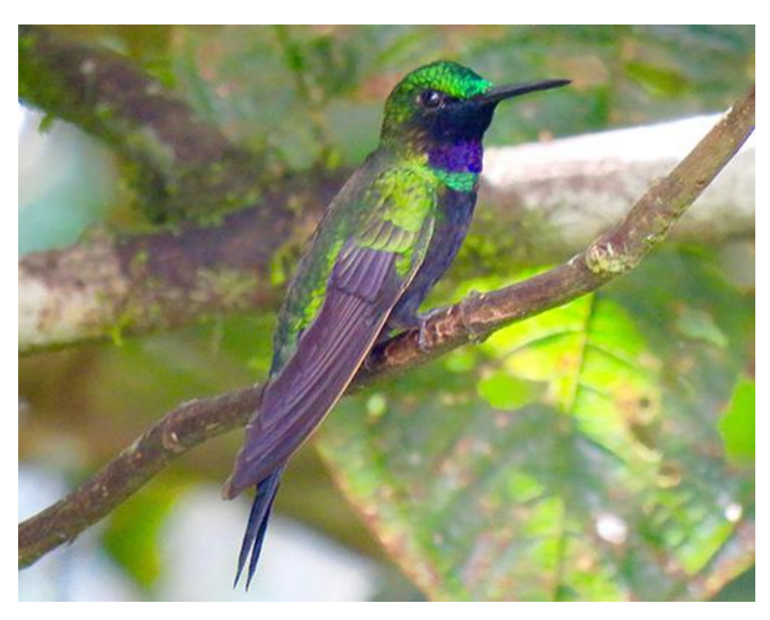
NIGHT: Casa Simpson, Tapichalaca Reserve